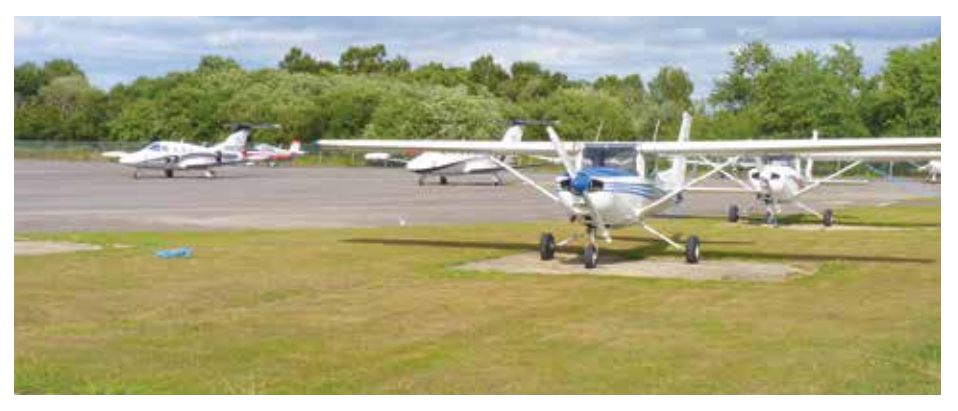
Part of the hardstanding on Yateley Common, at Blackbushe airfield in Hampshire; this is alleged to be the curtilage of the control tower but we are contesting the application for deregistration of the common.

registration inevitably implies a mistake by the authority, but the authority's role was as a statutory guardian of the register, and it had no discretion to refuse a request for provisional registration, however odd or misguided it seemed at the time—it was up to others to object, and for the commons commissioner to rule on the provisional registration.