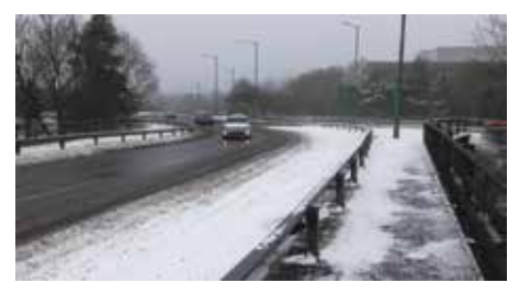
Bickenhill Clock Junction overbridge, the footway would become a third carriageway.

The scheme falls within Solihull Metropolitan Borough and is contrary to policy 18 in the council's local plan which is to promote, support and enhance physical and mental health and well-being