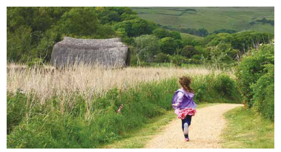
Our 150th anniversary photo competition continued