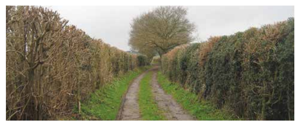
Highwoodhall Lane, Abbots Langley, Hertfordshire. Spotted as a route with public access but no longer to be found on the county's list of streets in 2010. Restricted-byway status applied for on 20 September 2010.

A good place to start is with an Ordnance Survey Explorer map of the area of interest. Examine this carefully, first paying particular attention to how paths are shown. On most maps, examples will be found of where footpaths change status to bridleway, bridleways change status to restricted byway, or any path seems to stop in the middle of nowhere, all for no clear reason. Each such change should be highlighted, and subjected to investigation using the evidence sources considered in previous OS articles.