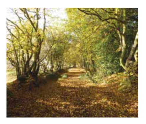
Ancient byway.

people around three sides of a rectangle. If the path is moved, an important part of Hertfordshire's history will be lost and users will be severely inconvenienced.