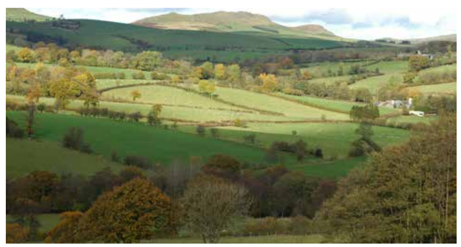
This view of Llandegley Rocks would have been obliterated by the turbines.

whereas the replacement land is hidden away and is a featureless field.