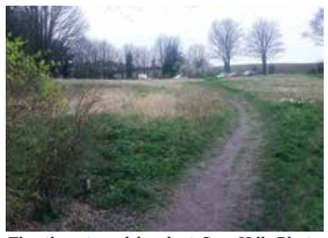
The threatened land at Sun Hill.

The Conservators of Therfield Heath and Greens wish to exchange 1.65 acres of common land off Sun Hill for the same acreage of woodland over a mile away. The exchange would enable eight houses to be built on the land at Sun Hill. We believe this land to be of value to the public, being immediately to the west of Royston and surrounded on three sides by housing making it a treasured open space. The replacement land is obviously too distant.