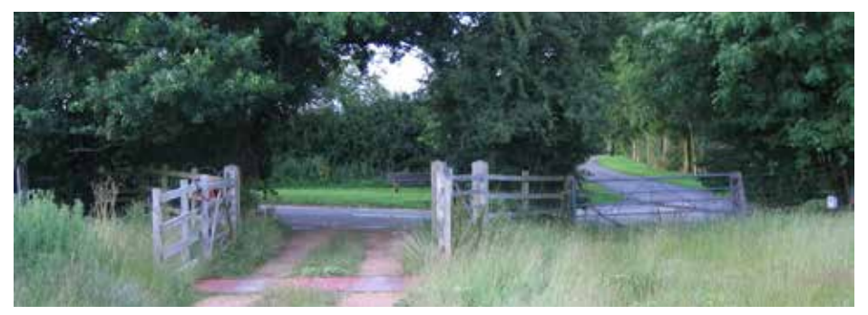
The Kineton application route joins the B4086 road on the far side of the gate on the right. The new track and cattle-grid on the left are not on the application route.

The application joined a long backlog, and the council said that it would defer maintenance and enforcement until the status of the route had been determined.