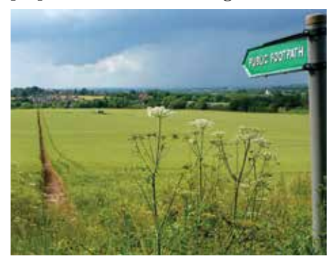
A well-maintained path near Melbourne, Leicestershire.

We want to see improved public access by paths and freedom to roam—which will support the local economy and people's health and wellbeing.