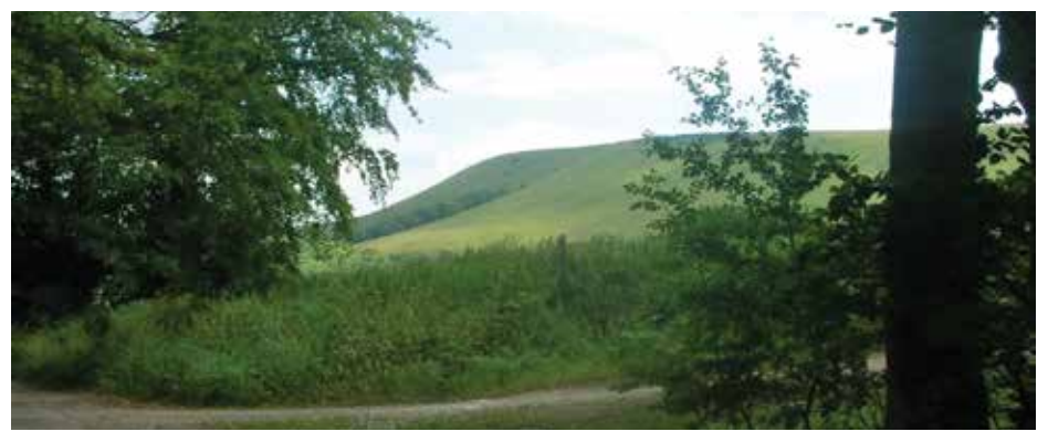
Firle Beacon from the Old Coach Road.

The commission received complaints about Oxfam on two separate issues, one in respect of an advertisement broadcast by social media calling for an end to the blockade in Gaza, and one relating to a tweet sent from the charity's twitter account, with a mock poster entitled The Perfect Storm about how austerity is forcing people into poverty,