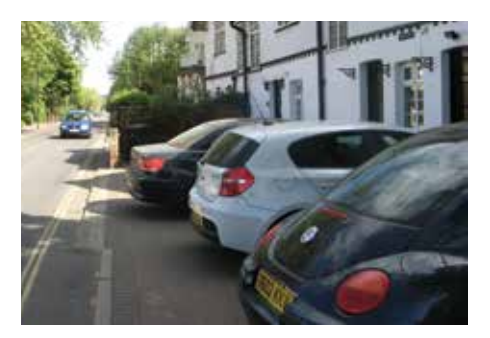
Ray Mead Road, an unsuitable route for a national trail.

Frightened by the prospect of large compensation costs, the council decided to improve the footpath along Ray Mead