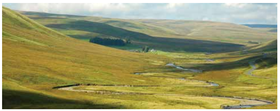
Access land, Elan Valley in mid-Wales.

The Manchester Corporation Waterworks Act 1879 allowed the construction of a reservoir at the lovely Thirlmere in the Lake District and the society won clauses giving the public the right of access to adjacent common land. These set an invaluable precedent, providing access to commons in the Elan Valley, mid-Wales, in 1892, and subsequently to others.