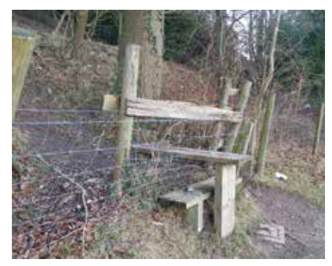
Badly-maintained stile in Ibstone, Bucks: this is the landowner's responsibility.

The act extended the definition of open country, on which access agreements or orders could be made, to include woodland, riversides and canal sides. The intention was to provide access close to