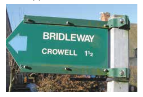
How it should be: signpost at Sydenham in Oxfordshire.

We are considering what action we might take to ensure that this important piece of legislation is followed in its halfcentenary year.