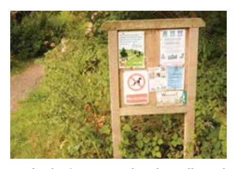
Backside Common, already well used.

When development take places on land close to a Special Protection Area (SPA), the highest form of protection offered by European legislation, the developers are required to provide Suitable Alternative Natural Greenspace (SANG) to accommodate the new recreation pressure which would otherwise impair the SPA.