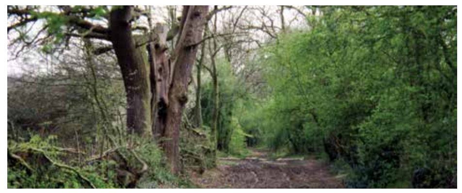
Whomsever Lane in Bushey, Hertfordshire, claimed by OSS members for the definitive map in 1992. Many unrecorded routes could be lost in 2026.

wealthy landowners and public schools being exposed for blocked paths or unpleasant path diversions. But most of the society's objections have involved unknown landowners and farmers.