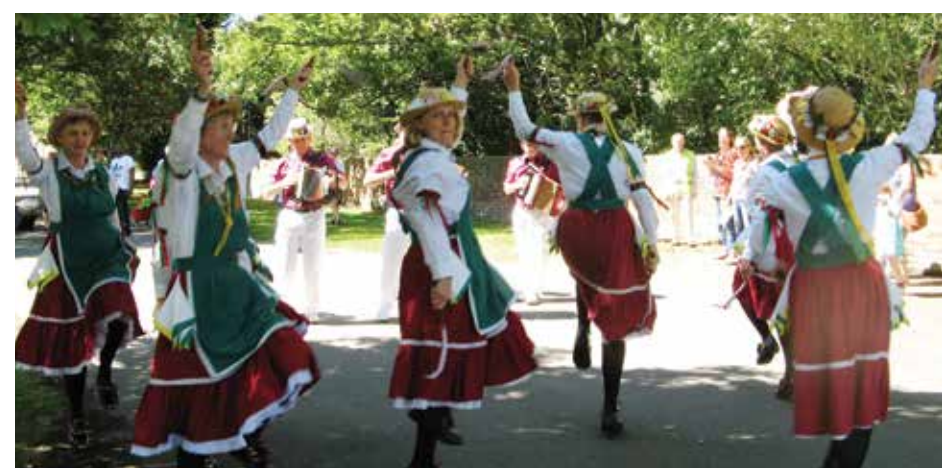
Taeppas Tump Morris perform at the Big Picnic on Wycombe Rye on 9 August. The event was organised by the High Wycombe Society and the OSS to celebrate the fiftieth anniversary of saving the Rye from an inner relief road. Hundreds came from far and wide to enjoy the entertainment and to picnic on the Rye.

roads and other works. Much of this is on registered common.