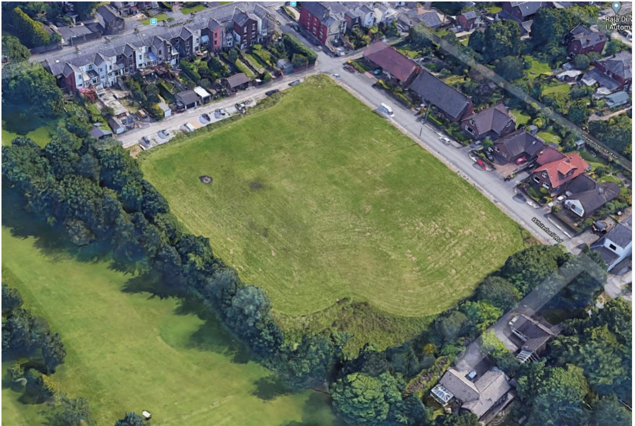
Extracts from Google Street View

Whether it is realistic to think that there can continue to be non-ancillary use of the building or other land which will further (whether or not in the same way) the social wellbeing or social interests of the local community?