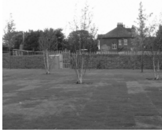
Ealing’s new pocket-common.

Common land in Llangoed threatened by development.