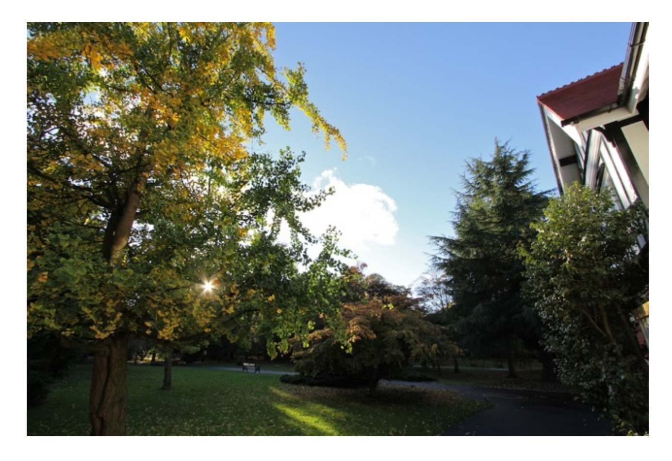
Marie Louise Garden, West Didsbury, Manchester