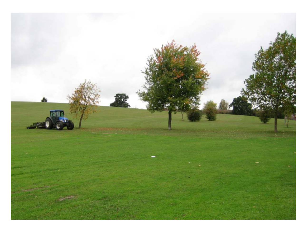
Jessel Green, Loughton, Essex

This is an area of high-density housing, with a number of green areas, large and small, highly valued by local people. Jessel Green (8.32 hectares) and Rochford Green (0.97 hectares) are both owned by Epping Forest District Council and form part of the Debden housing estate. They were listed as potential housing development sites in 2008 and are still under threat.