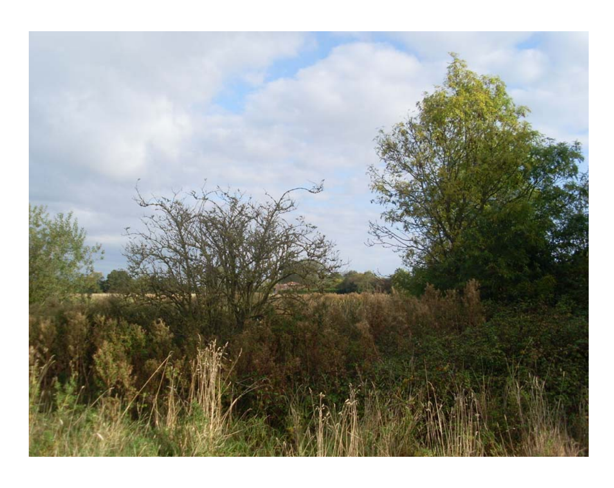
The pond at Ilketshall St Andrew, Beccles, Suffolk before reclamation work