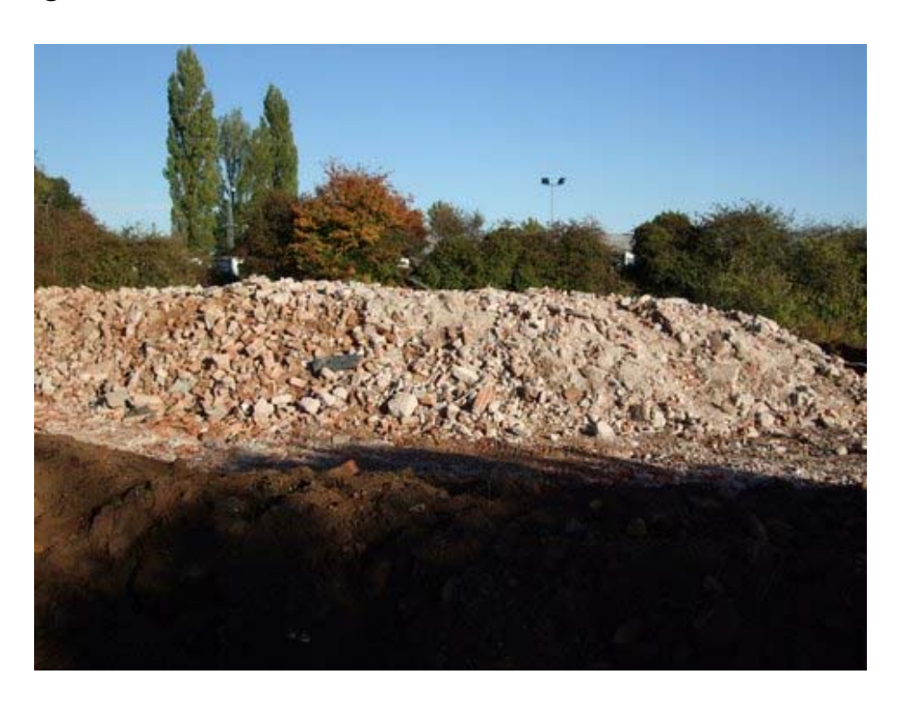
Bulwell Hall Park and adjacent Blenheim Allotments

In spite of this, part of land has been developed for housing, and 10-foot-high embankments and ditches surround most of the park. Part has been used as a landfill site for at least four years, with a waste management licence.