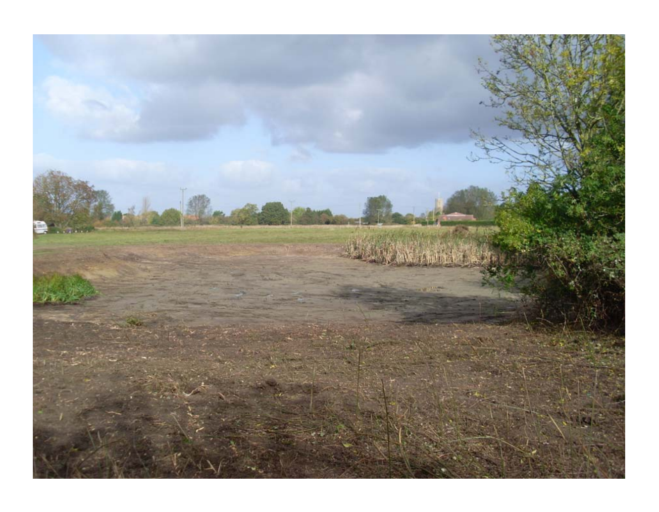
Rejuvenated pond at Ilketshall St Andrew after reclamation work

The Ilketshall St Andrew and St John Land Management Company Ltd manages seven commons, totalling 40 hectares, around some villages in Suffolk. These provide interesting spacious areas for local people to enjoy for walking, horse-riding, bee-keeping, bird-watching and as a recreation area. Most of the grass is cut for hay each year and the whole area is run under the Higher Level Stewardship scheme to encourage flora and fauna. The company considers that this provides a model for others, and for the proposed green-space designation.