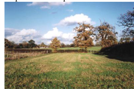
1941 path, user evidence only, negotiation and dedication by landowner, took about two years.

Below are examples of well-used paths which were missing from the definitive map but are now put on it.