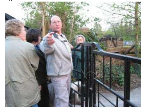
Over 100 years old, short bit missing off definitive map, obstructed by new owner, WCA claim opposed, took ten years, highway authority.