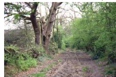
Over 200 years old, bridleway, user evidence plus historic, WCA claim, unopposed, took about one year (district council through agency agreement).